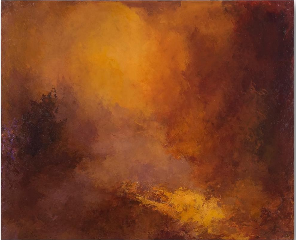
Alice Zinnes— Lost Tenderness in the Empty Space of Touch