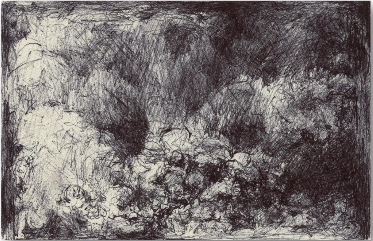
Alice Zinnes— Cascades of the Night